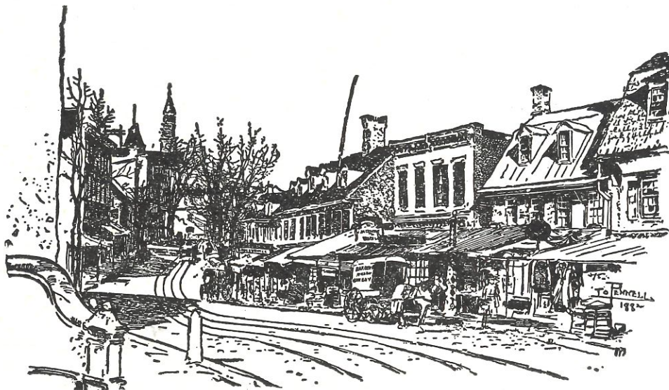
OLD VIEW OF MAIN STREET Looking North from School House Lane