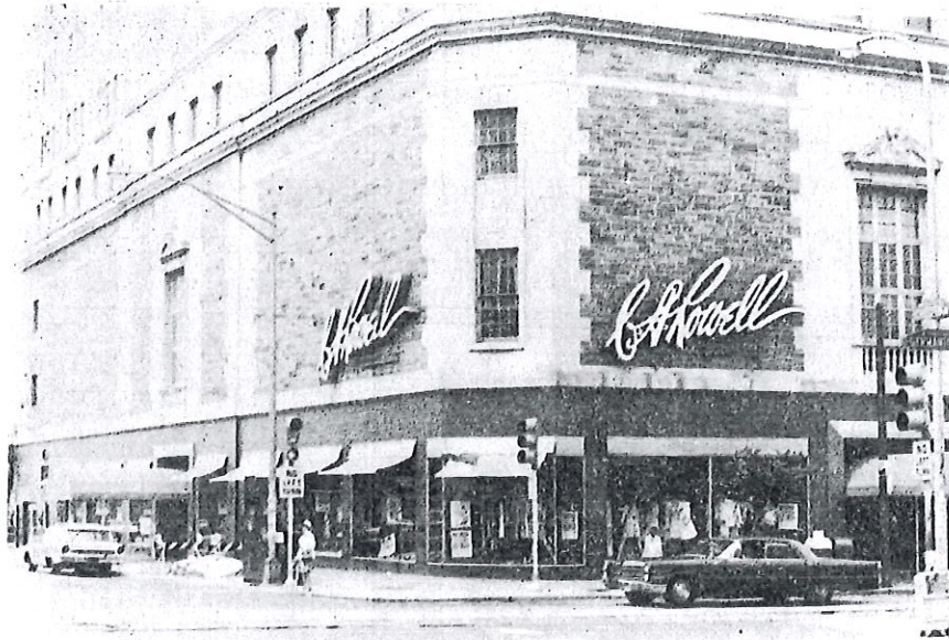
C. A. Rowell Department Store Corner of Germantown and Cheltenham Avenues