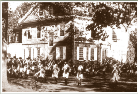
During the revolution, The Battle of Germantown was fought up and down Germantown Avenue, with British soldiers firing on American patriots from the windows of Cliveden.

HISTORIC GERMANTOWN PRESERVED 5501 GERMANTOWN AVENUE PHILADELPHIA, PA 19144 215.844.1683